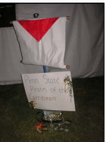
Making cancer walk the plank!